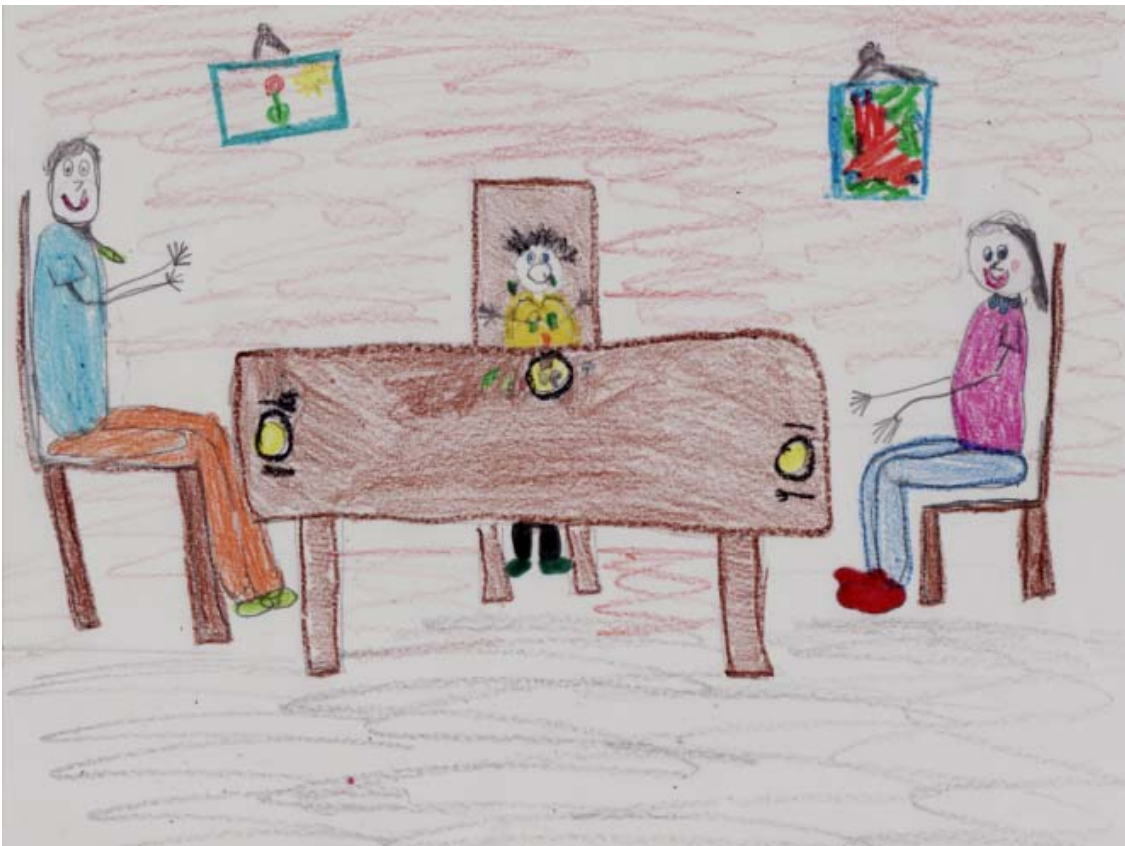
Drawing by Ariana Glover Age 9

“Chew your food with your mouth closed, get your elbows off the table, eat with your fork, get your finger out of your nose and stop blowing bubbles into your milk,” Mary Riplan yelled at her 11 year-old son. “Do you think you were born in a barn or something?”