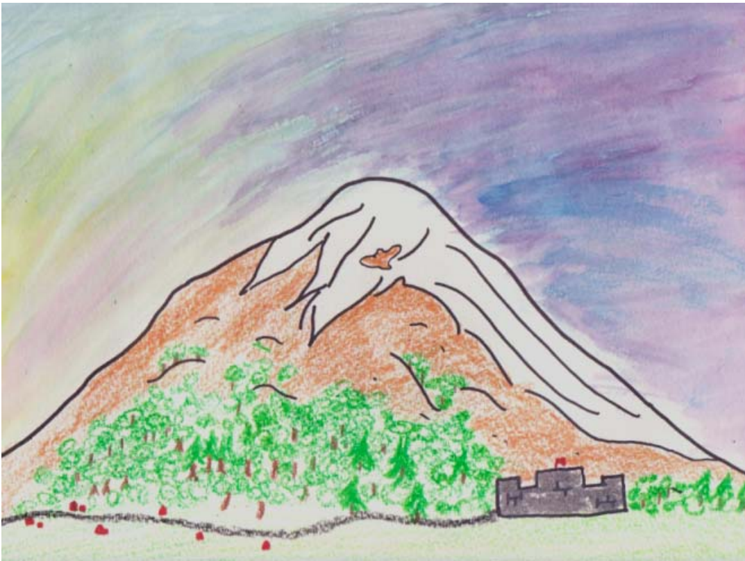
Drawing by Chris Glover

After a long tiresome walk, Jordan and Elderan emerged from the path onto a larger dirt road that stood in the middle of the forest. From here you could see a mountain at the edge of trees. If you looked closely, the mountain looked like a folded napkin.