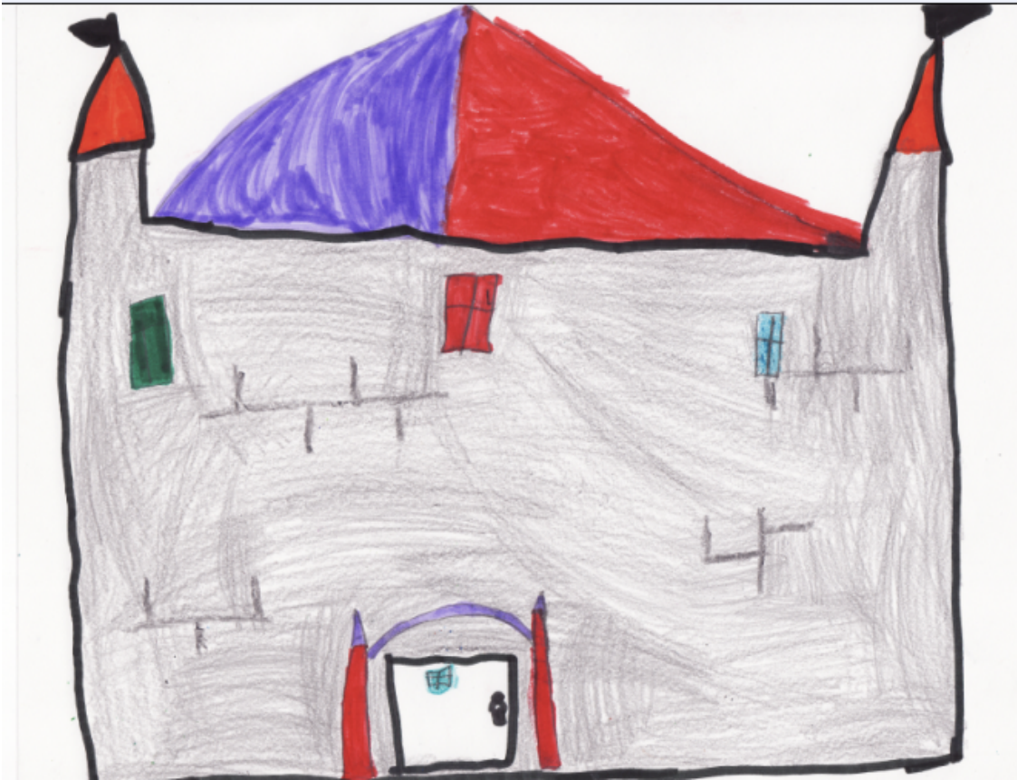
Drawing by Ariana Glover Age 9

Elderan and Jordan walked a short distance to the very centre of Politeeville. There stood a large castle, with beautiful trees and grass surrounding it.